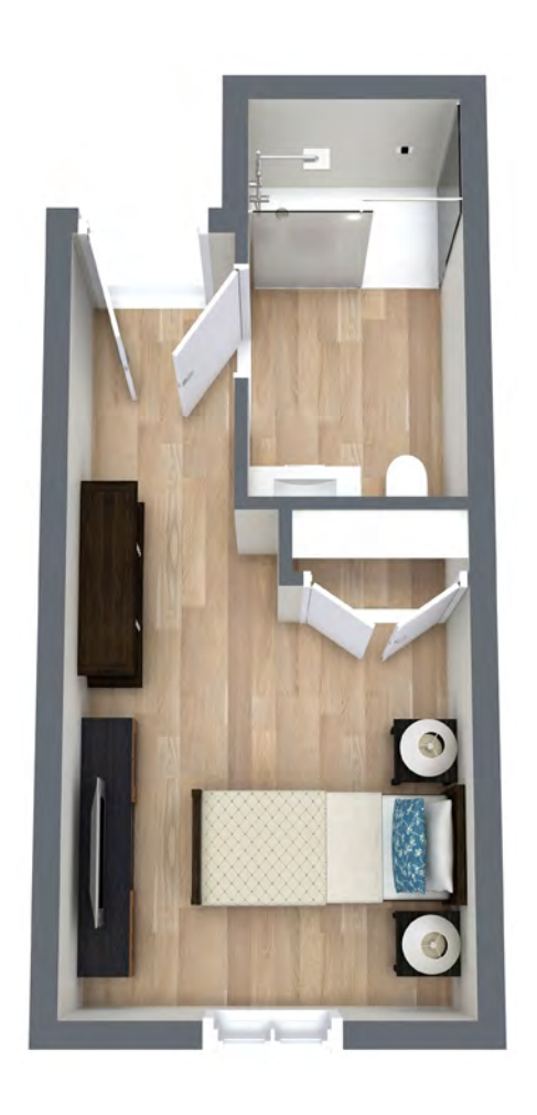
PRIVATE B One Bedroom- Suite