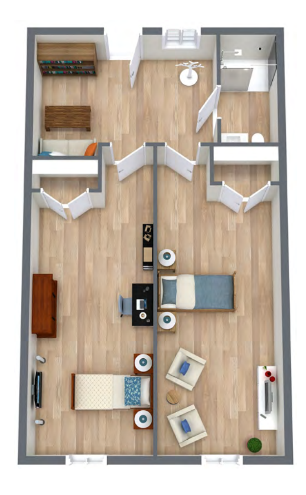
SEMI-PRIVATE B Two-Bedroom Suite